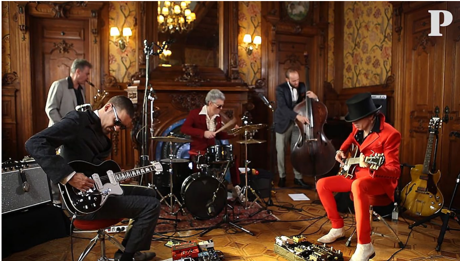
Figure 3. Dead Combo, or tradition revisited. 1 1

politics from the push and pull of power and resistance. Fado is instead committed to embracing the challenges of interdependent contradictions and to maintaining flexibility and autonomy in negotiating these. Fado leverages the power of empowerment through its capacity to reveal contradictions, to articulate struggles and identify possible alternatives. We can consider this dimension as the dance of fado, understanding tensions as signs of vitality evident in reflexivity and debate.