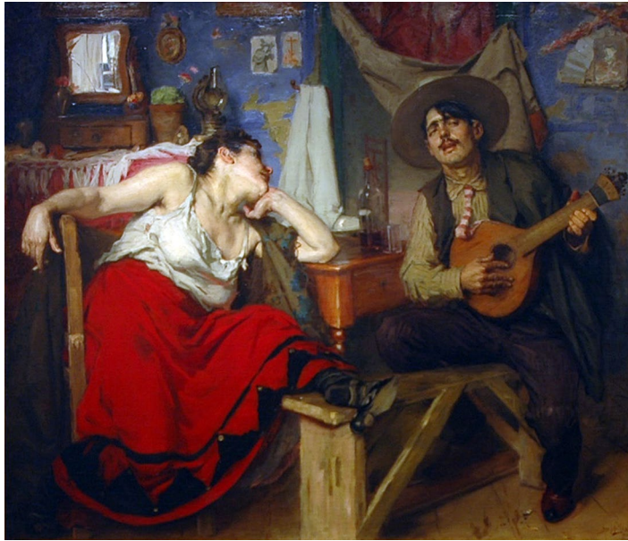
Figure 2. The tradition of Fado: O Fado, by José Malhoa (1910). 1

1 “Lisbon O fado, José Malhoa, 1910” by D-Klick is licensed with CC BY-NC-ND 2.0. To view a copy of this license, visit https://creativecommons.org/licenses/by-nc-nd/2.0/ .