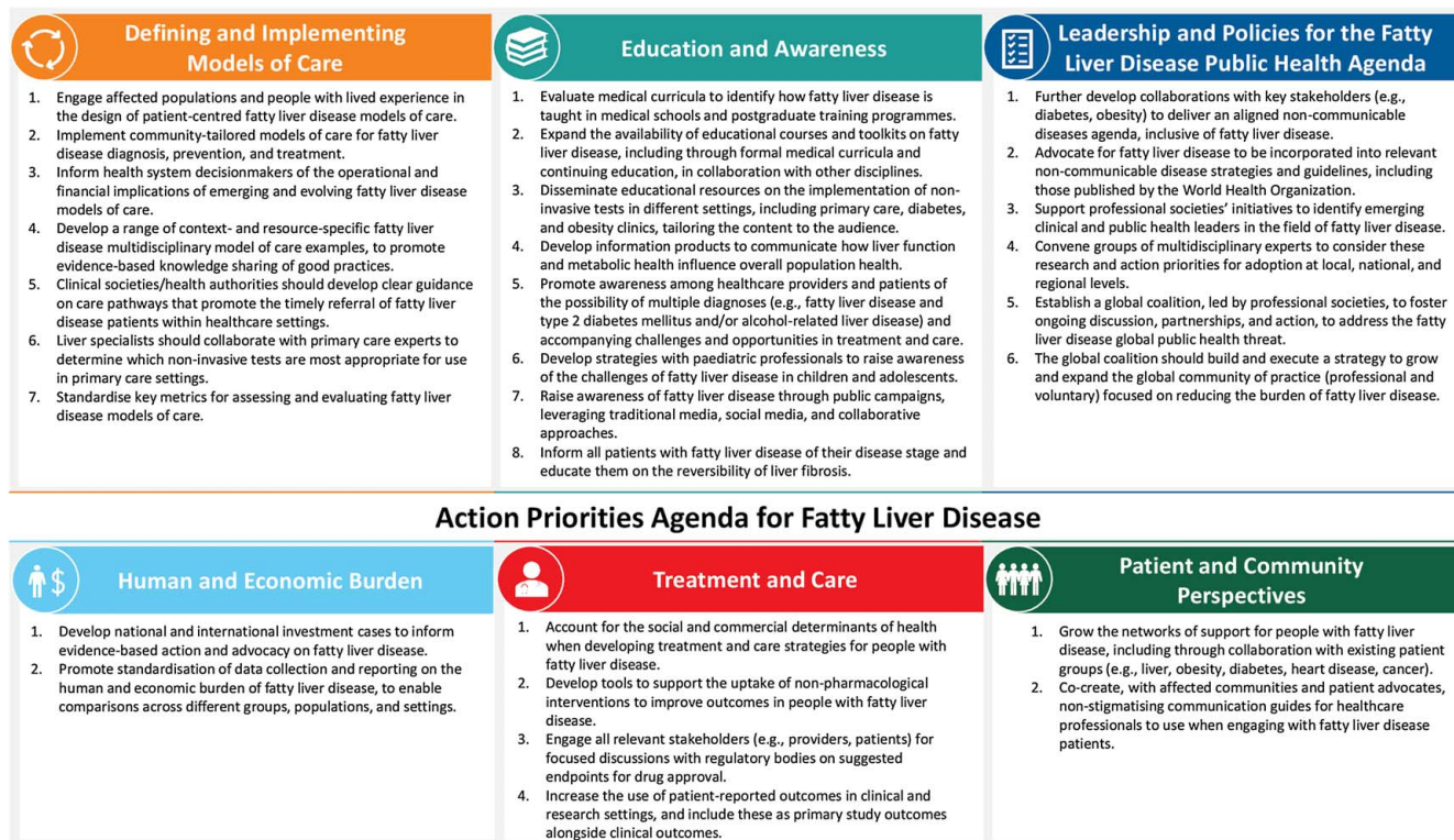
FIGURE 2 Action priorities to turn the tide on fatty liver disease.

the importance of action but the health and economic benefits of this.