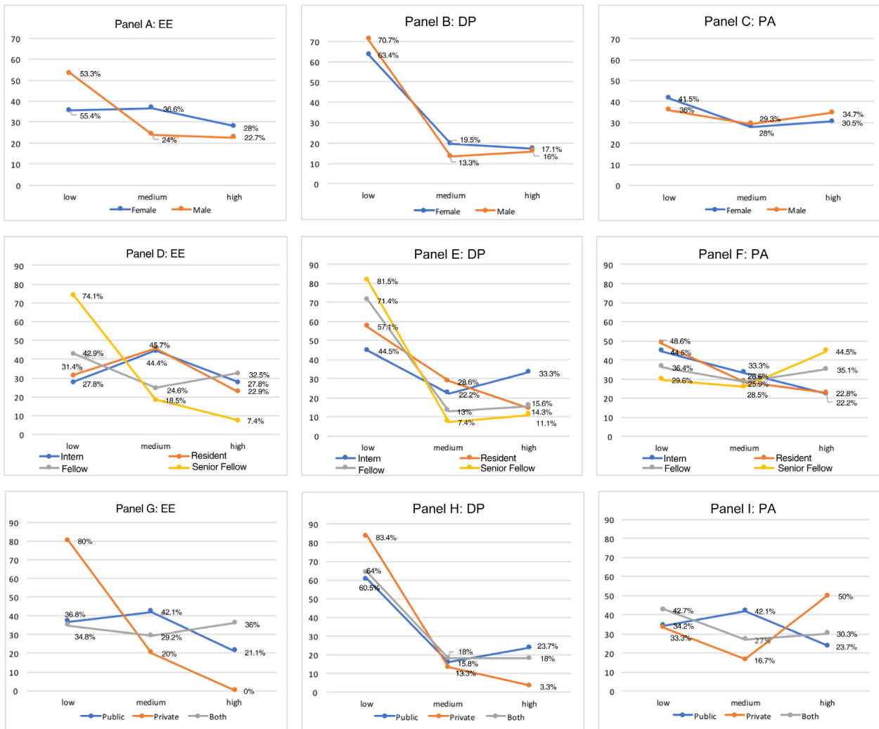
Figure 3 Levels of burnout dimensions by gender, professional level, and sector. DP: depersonalization; EE: emotional exhaustion; PA: personal accomplishment.

goal, sociodemographic, professional, and health-related data were analyzed.