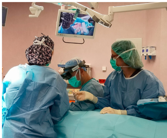
Fig. 4. In action: surgeon wearing Hololens headset at the surgical theater.