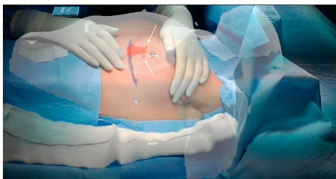
Fig. 5. - Surgeon view of the phantom model (with tumor location) synchronized with the patient through augmented reality. An overlap is observed between the two carbon tattooing marks (white arrows) and tumor projection with augmented reality in the red colour.

Pathology: 17 mm tumor was removed consisting of intermediate grade DCIS with free margins and one negative sentinel lymph node. No invasive cancer was found. Final TNM staging was pTis pN0(sn)cM0.