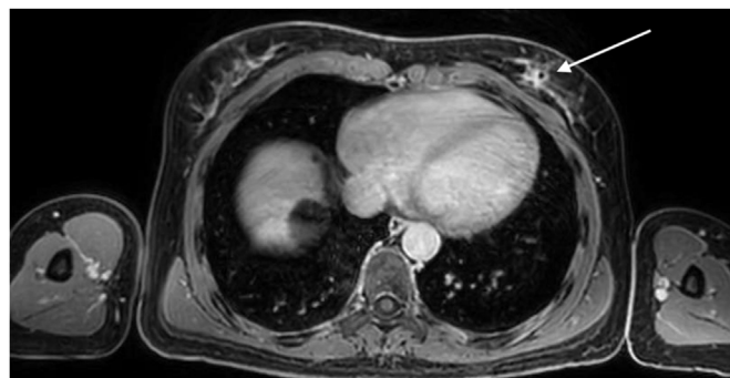
Fig. 2. Left breast cancer lesion with clip artifact visible at MRI with the patient in the supine position.

overlap between both modalities, including tumor, using BSM to perform spatial alignment between both modalities (Fig. 3). A patient-specific 3D digital breast model was processed and converted to a point cloud breast 3D model, referred hereafter as phantom model (Fig. 5), ready to be uploaded to an AR headset: HoloLens 1.