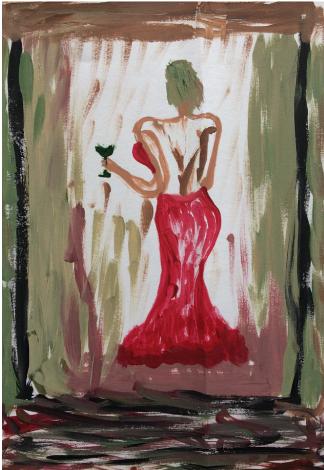
Figure 4. Work carried out during First Aid with Art Therapy sessions.

inine emerges as a regulating function, and like all symbols it appears spontaneously, and this occurs due to the freedom of the process. Therefore, it can also be observed that as a general rule, when directed, this pattern does not emerge in the same way, causing some barriers to the connection between the person and the art. Curiously, however, it can be found that in the case of men who are in family camps, this pattern does not become so repetitive. In these cases, it was observed that there is a more diverse influx of images. Landscapes appear more. The situation is different as most of them are fathers and life in a family camp, one could say, has certain differences. These participants are with their wives and children, and although the place is not properly that of a home, there is a family nucleus and a community life among all the families living there.