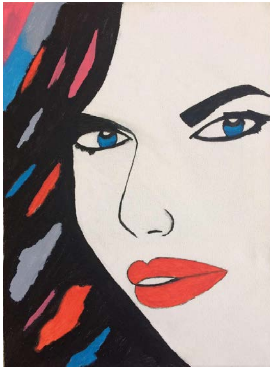
Figure 5. Work carried out during First Aid with Art Therapy sessions.