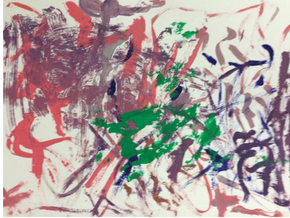
Figure 6. Work carried out during First Aid with Art Therapy sessions.

directionless. This improves the power of decision and a feeling of freedom. In both forms, whether they are created or simply colored in, the beneficiaries concentrate on the smallest details with a high degree of patience and commitment.