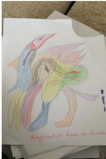
Figure 9: Work carried out during First Aid with Art Therapy sessions, where the refugee added their own title: “Imagination have no Border”.

Arriving at this point it is possible to conclude that an Art Therapy practice in such a susceptible context, even more so with the increased stress brought on by the Covid-19 pandemic, could only achieve its objective, namely to restore well-being and inner peace in an emergence context and from the first aid perspective, if it was based on a methodology of free artistic expression combined with relaxation practices facilitated by simple movements and breathing practices of yoga, as well as music therapy and sound therapy.