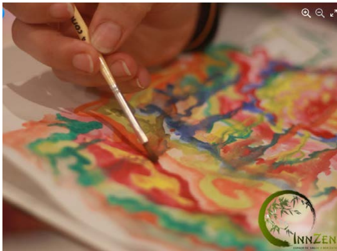
Figure 3. Free Artistic Expression in Art Therapy Sessions.

The materials available to participants in the Art Therapy sessions are: drawing paper, brushes, palettes, watercolors, acrylic or oil paints, colored paper, drawing pencils, erasers, sharpeners, glue, scissors, canvas of different sizes, and also Recyclable Material, such as: magazines, toilet paper rolls or paper towel rolls, empty boxes, rope, etc. The guidelines for this activity are: try to be silent during the creative process, freedom to paint whatever they want and in whatever way they want. At the sessions, each participant chooses the place and the paper where they will proceed to paint. Participants place the paper on the walls, while the rest of the material is displayed on the table in the center of the room. Relaxation music is selected, preferably instrumental, at a low volume. At the end, the group sits in a circle and starts to share the experience. The facilitators ask questions to initiate the dialogue. Participants will be asked to share the experience they had during the artistic process. If anybody prefers not to, there will be no pressure to do so.