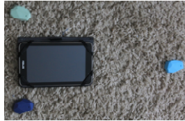
Figure 1. One configuration used to measure the estimated distance between Estimote beacons and a tablet

SDK), which estimates a distance between a beacon and the device running the app. We also collected the correspondent Received Signal Strength Indication (RSSI) values received from the beacons, on which the calculated distance is based. For that, we used different scenarios, with several beacons' arrangements and number (Figure 1). After that, we develop a tool to collect, store and present information regarding beacons' RSSI values in the form of graphic, aiming at testing beacons' main functionality: detect proximity. Beacons were placed a few meters apart and, carrying the tablet, we started approaching one at a time to check if we could match our path in the graphic.