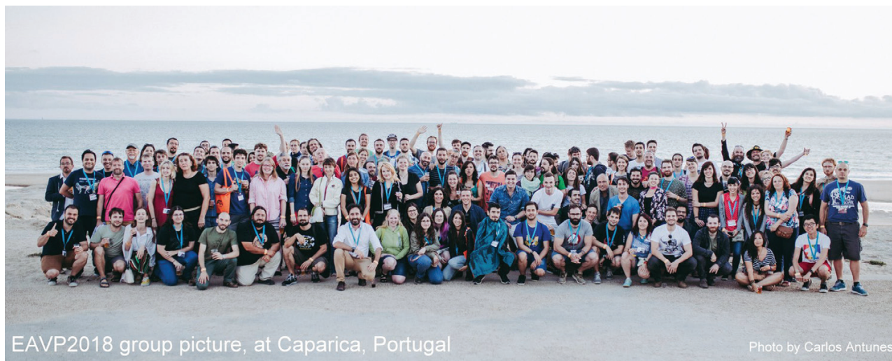
Figure 1. Group photograph of the participants in the XVI Annual Meeting of the European Association of Vertebrate Palaeontologists (EAVP).