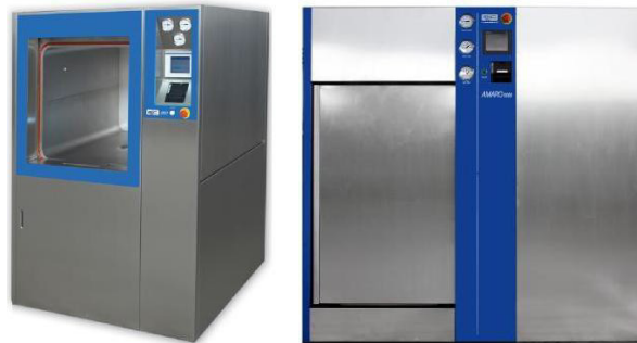
Fig. 4. (a) former sterilizer AMARO 5000 with the door vertically; (b) new sterilizer AMARO 5000 with the sliding door horizontally

This project aims to achieve significant improvements in the quality of the sterilization process, simplifying the maintenance of the equipment, the traceability of the processes and equipment, the quality of work of the operators of sterilization station, making easier the sterilizer manufacture and assembly processes, the improvement and introduction of a new concept of charging system of the sterilizer. The developments described will allow company to submit an innovative concept that will be introduced in hospitals of medium and large dimensions.