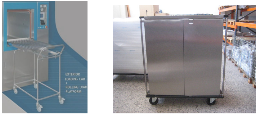
Fig. 3. (a) former loading system; (b) new loading system