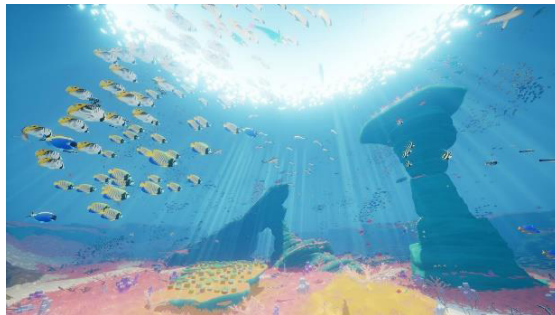
Fig. 4 The different areas and ecosystems that you can explore in Abzû .

During the first minutes of gameplay, the soundtrack intensifies and adds more instrumental textures, accentuating the harps and introducing a chorus, emphasizing the female voices with open phonemes. The orchestra, in Abzû , represents all the present life in the different “oceans” that the player can (and must) explore, repeating and transforming the main theme, creating small motives that facilitate the empathic relation of the player with the narrative. This main theme is also associated with another character of Abzû , the Shark, who appears at specific moments in the protagonist’s journey and who, initially seen as a threat, is in fact a guide and potential divine entity in this oceanic universe.