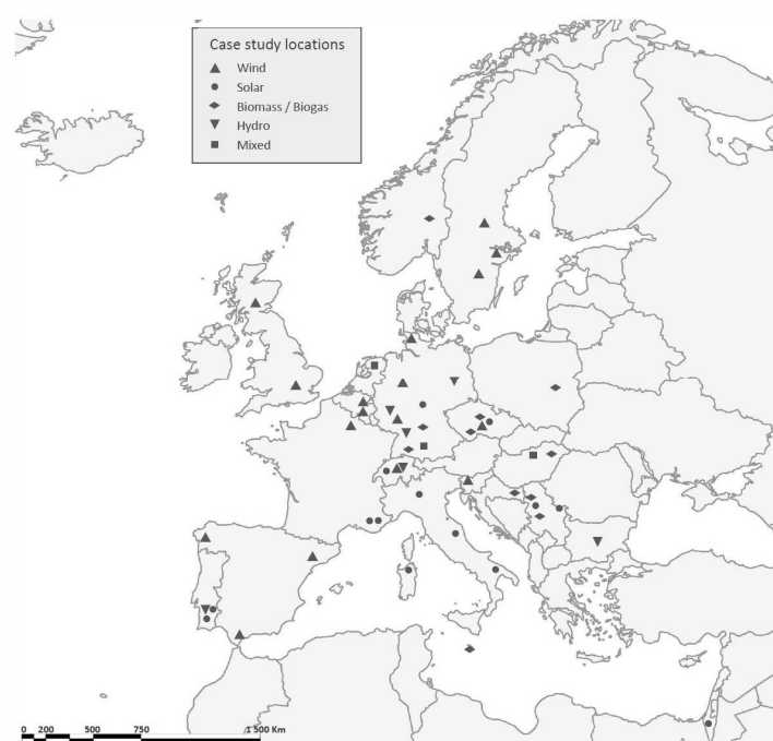
Fig. 1. Location of European smart practice case studies.

countries; (iii) special construction systems for solar panels allowing cultivation and farm mechanization underneath from Italy; and (iv) the project of cultivation of wild flowers and plants as an alternative source for biogas production in Germany.