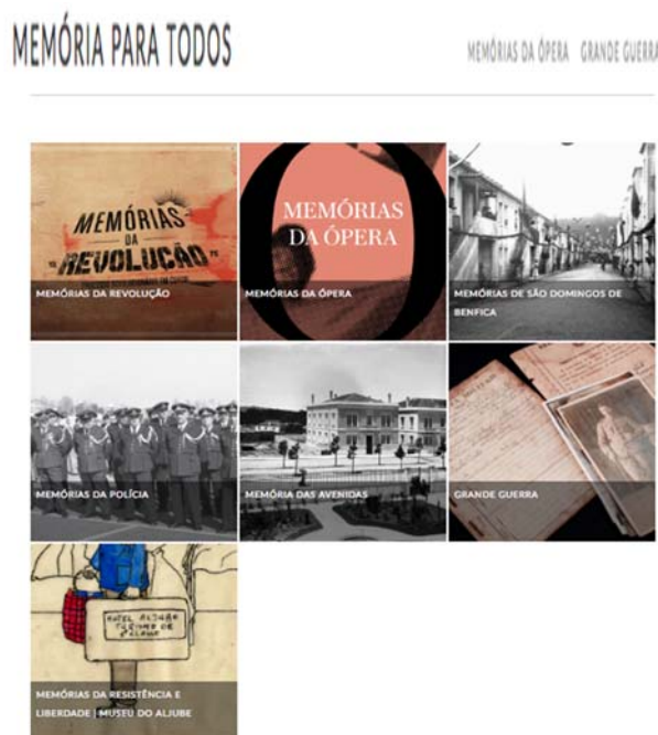
Photo 2. The current aspect of the platform Memória para Todos , featuring the several projects.

Currently, the programme is dedicated to several subject areas such as the Portuguese Revolution of 1974 (with the National television, RTP), the Portuguese Opera (together with São Carlos National Theatre), the Resistance and Freedom (with the Aljube Museum, dedicated to the memory of those who experienced imprisonment and took part in the movements for freedom and democracy during the Portuguese dictatorship of 1926-1974), the Police (as part of the Museum of the Police project), Memória das Avenidas and Memória de São Domingos de Benfica . The last two projects have a distinct approach, focusing on local urban history, following particular engaging and collaborative research strategies, which we hereby intend to present.