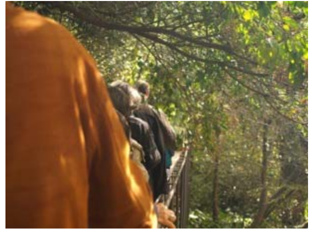
Photos 5 and 6. Visit to the Calouste Gulbenkian Garden with the Architect Teresa Bettencourt da Camara