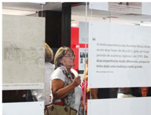
Photo 4. View of the installation at Picoas Plaza. September 2016.

The venue, at Picoas Plaza commercial area, was granted by the local council, after requested by one of the main partners and collaborators in the project. The group meetings took place there while the exhibition was on display.