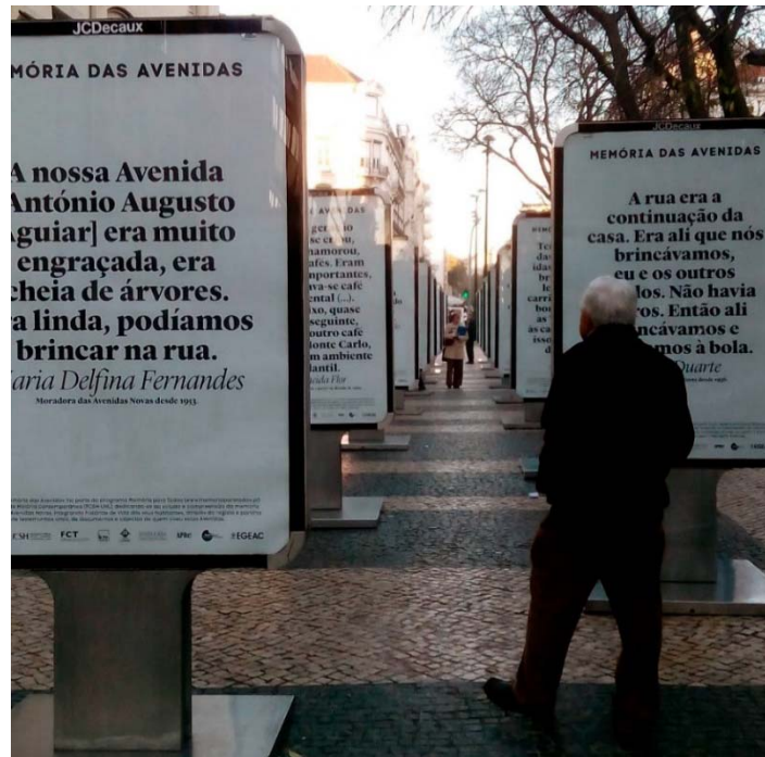
View of the exhibition Memória das Avenidas at Av. Duque de Ávila, Lisbon. February 2017